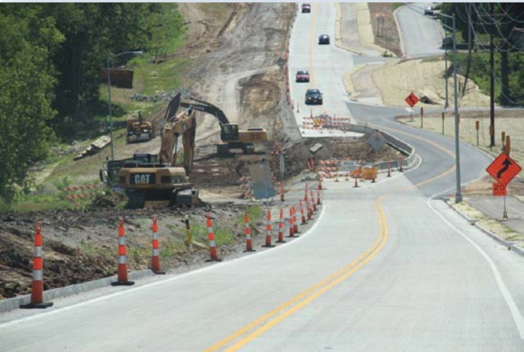
Grading crews prepare the roadway for paving the west bound lanes.